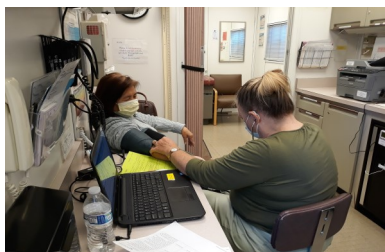
Twice each month, Lahai's Mobile Medical Clinic visits CrossView Church in Snohomish. Our work there is supported by many Snohomish community churches.