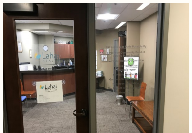
Above: Lahai Dental's welcoming lobby is comfortable and professional.

We count on the generous support of friends like you! Please visit Lahai.org and click DONATE.